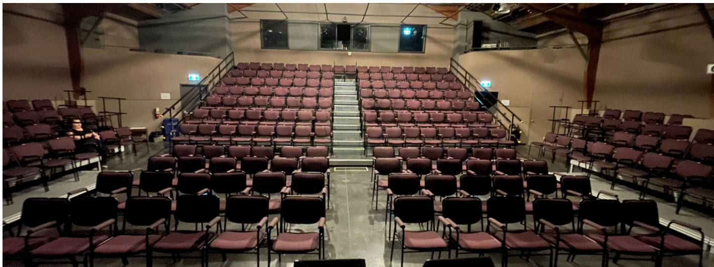
view of the theatre from the stage