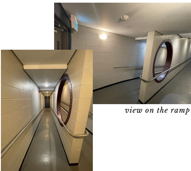
view on the ramp

Follow the ramp around to the entrance of the theatre where a Front of House staff will give you a program for the show.