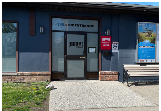
view of the theatre front entrance