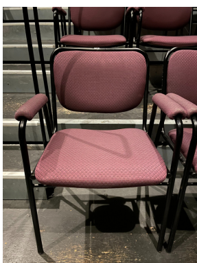
view of the theatre seats

Theatre staff will be available to help you get to your seat if needed.