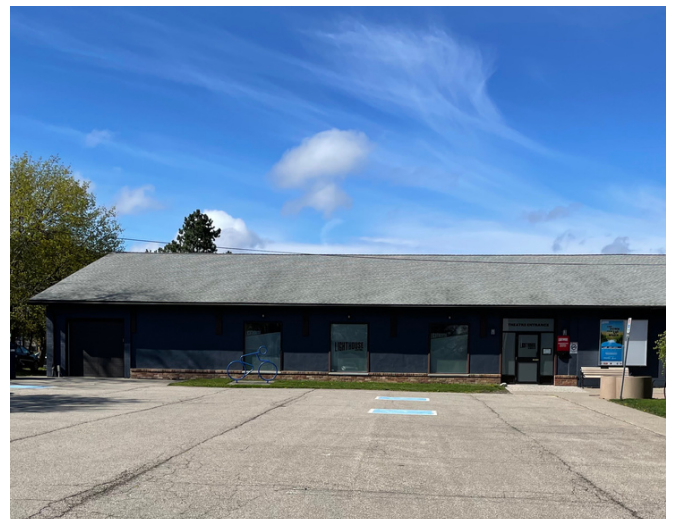
view of the parking lot

When you enter the theatre a Front of House staff will be ready to greet you!