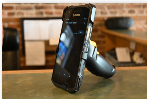
scanner for tickets

Say hi and feel free to ask anyone wearing a name tag for help if you need it.