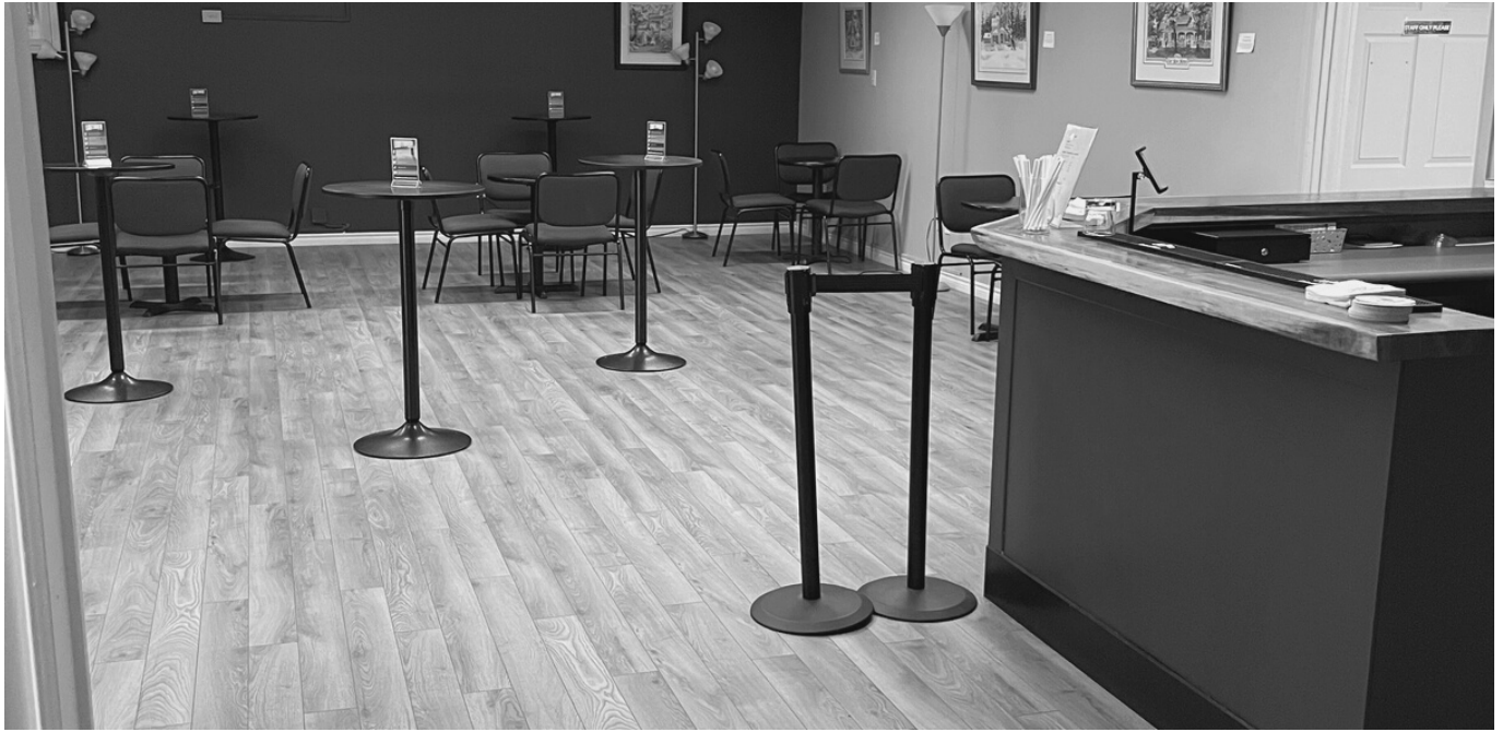
view entering the Lounge from main hallway