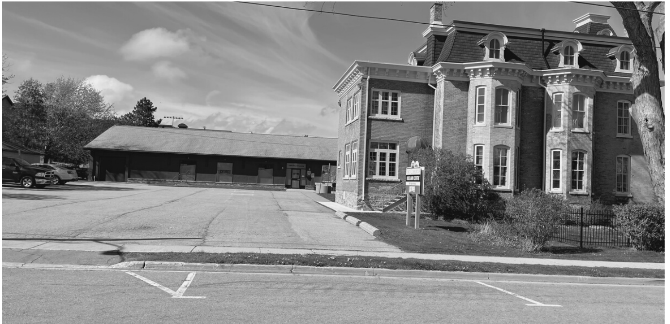
view of the theatre from Carter Street