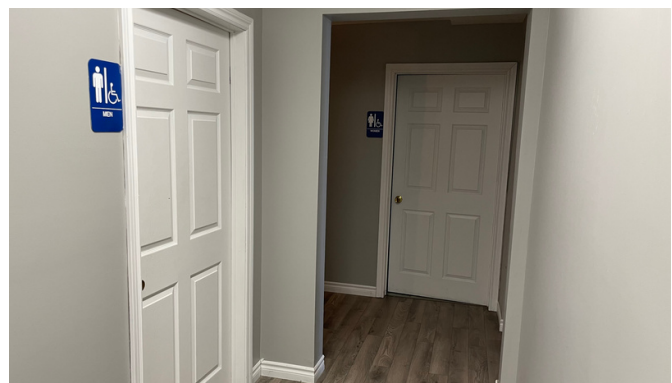
view of wathrooms

Wathrooms are off the main hallway as well, accessible washrooms are marked with the blue sign seen below.