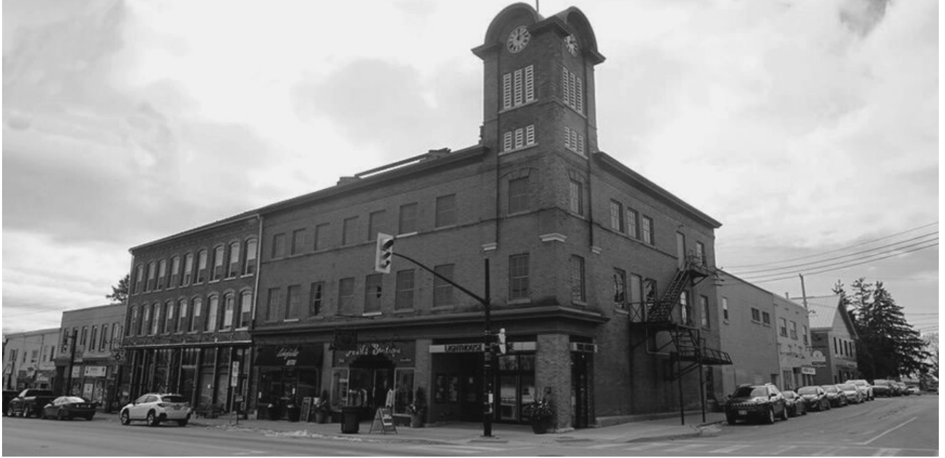
view of the theatre from across the street at Powell Park