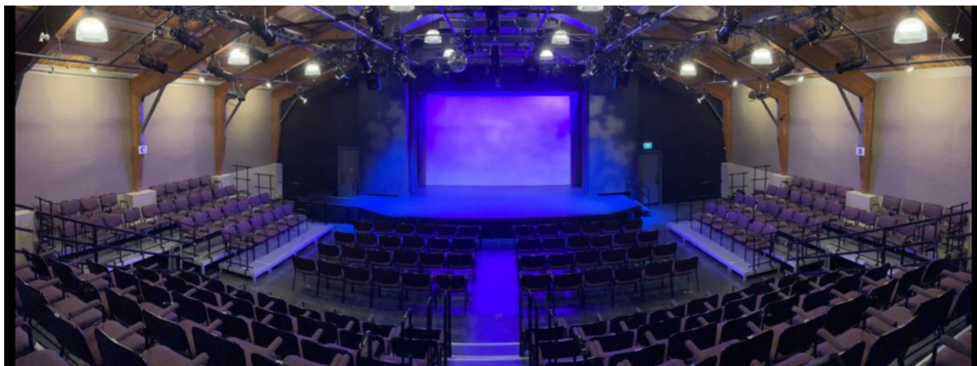
view of the theatre from the back of the theatre